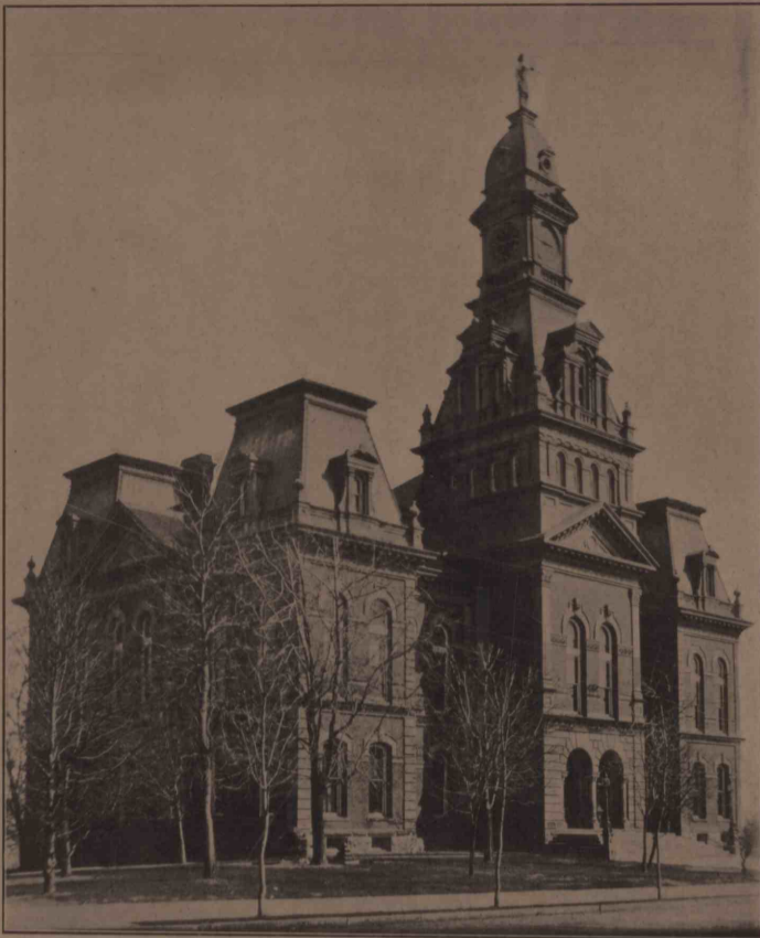
Cambria County Court House

Geological and Geographical MAP OF CAMBRIA COUNTY, PA.