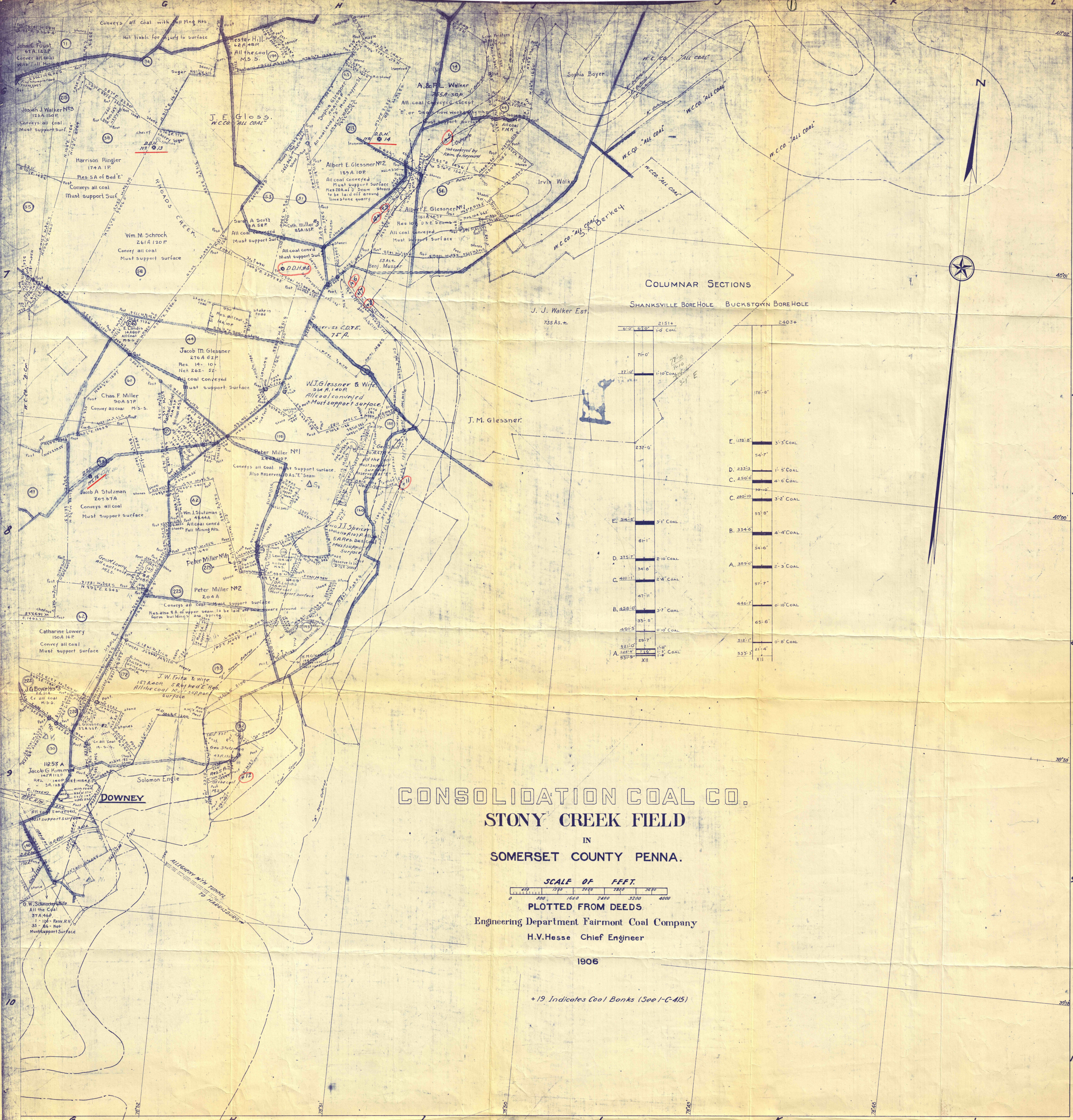
COLUMNAR SECTIONS SHANKSVILLE BORE HOLE BUCKSTOWN BORE HOLE