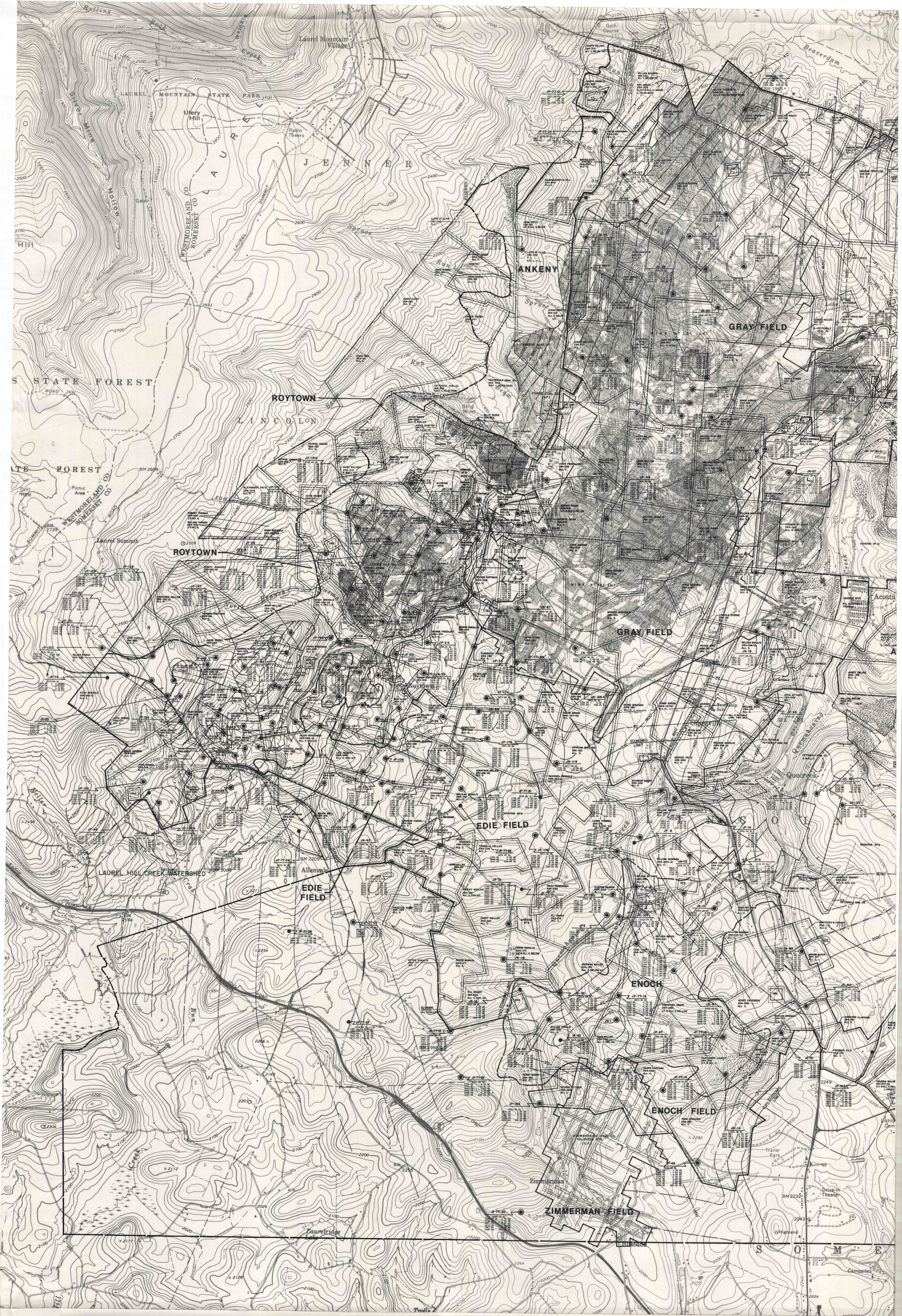
COUNTY LOCATION MAP