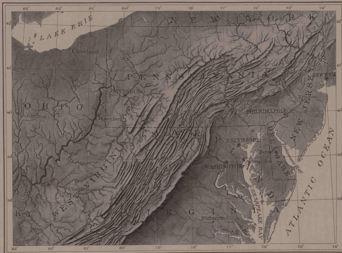
FIG. 3.—RELIEF MAP OF THE NORTHERN APPALACHIAN MOUNTAINS. The Elders Ridge quadrangle is situated on the plateau west of the belt of valley ridges, in the west-central part of Pennsylvania.