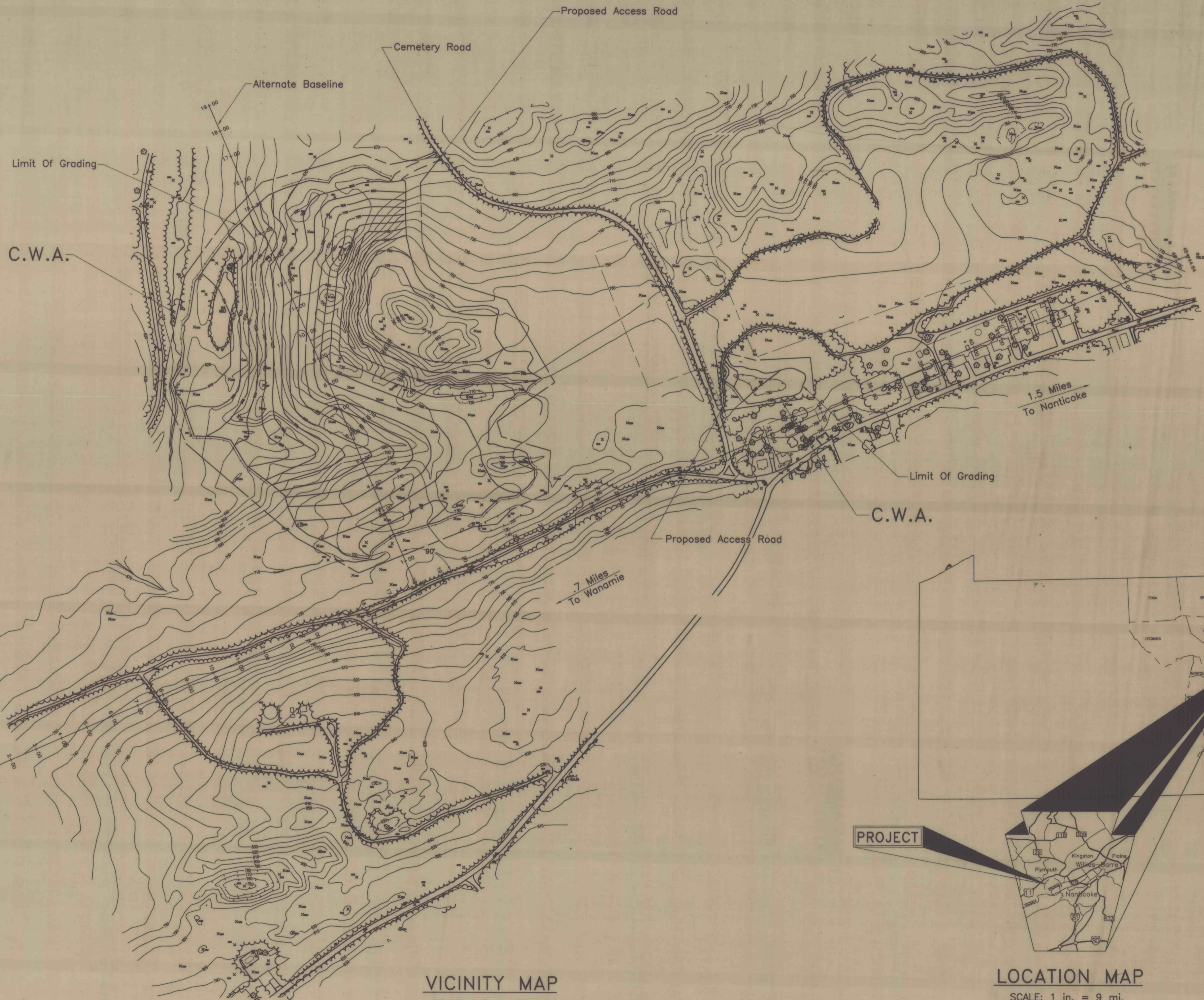
VICINITY MAP SCALE: 1 in. = 200 ft.