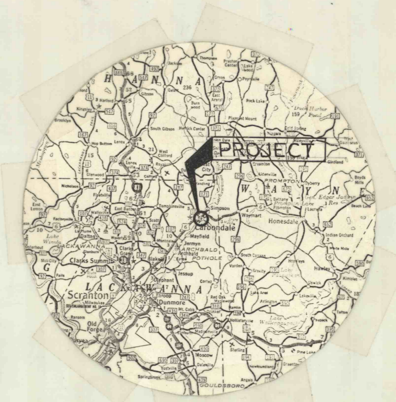
LOCATION MAP SCALE - 1" = 9 miles