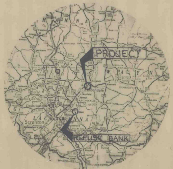
LOCATION MAP SCALE - 1" = 9 miles