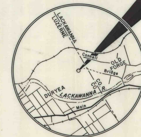
LOCATION MAP Scale 1 in. = 2,000 ft.