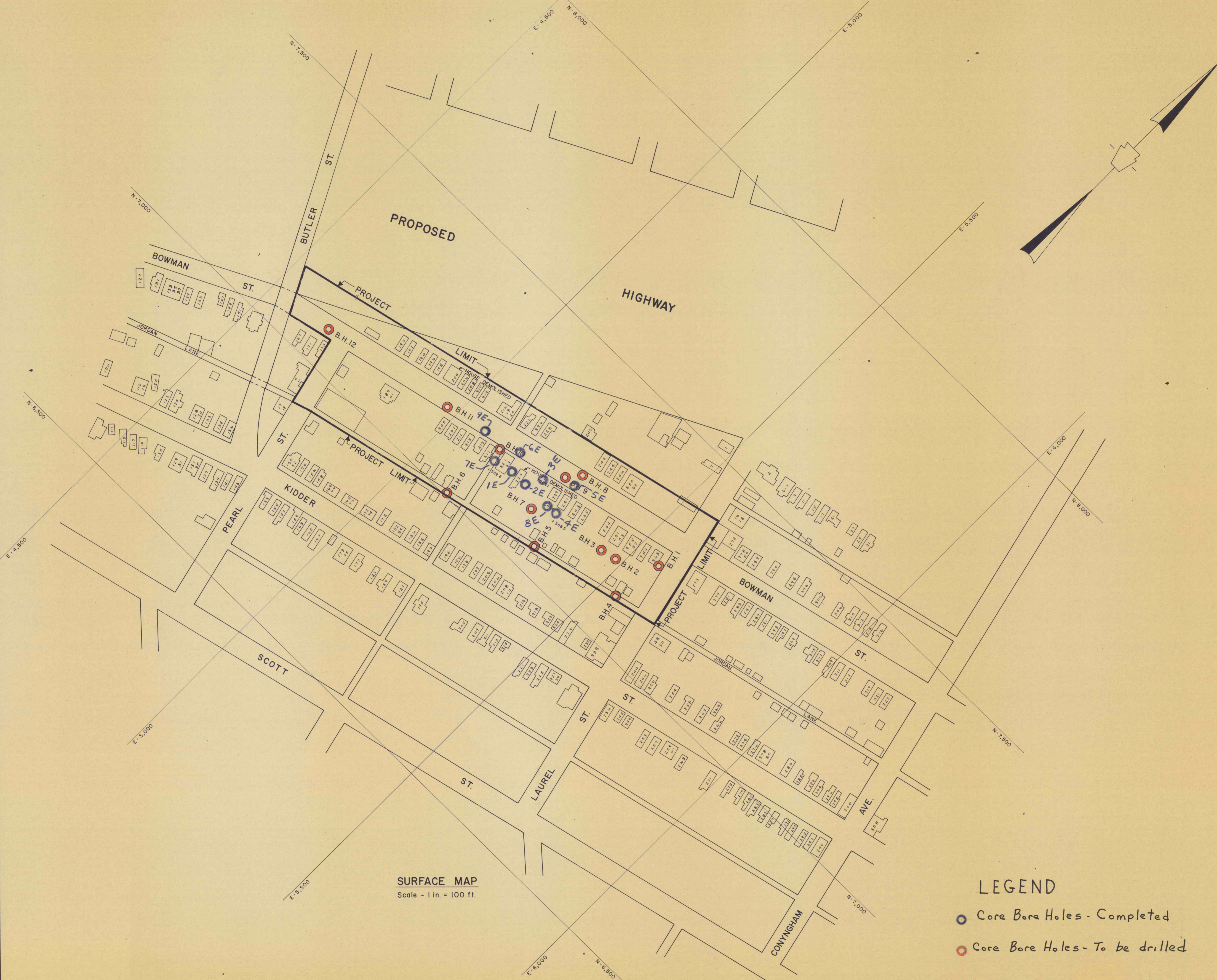
SURFACE MAP Scale - 1 in. = 100 ft.