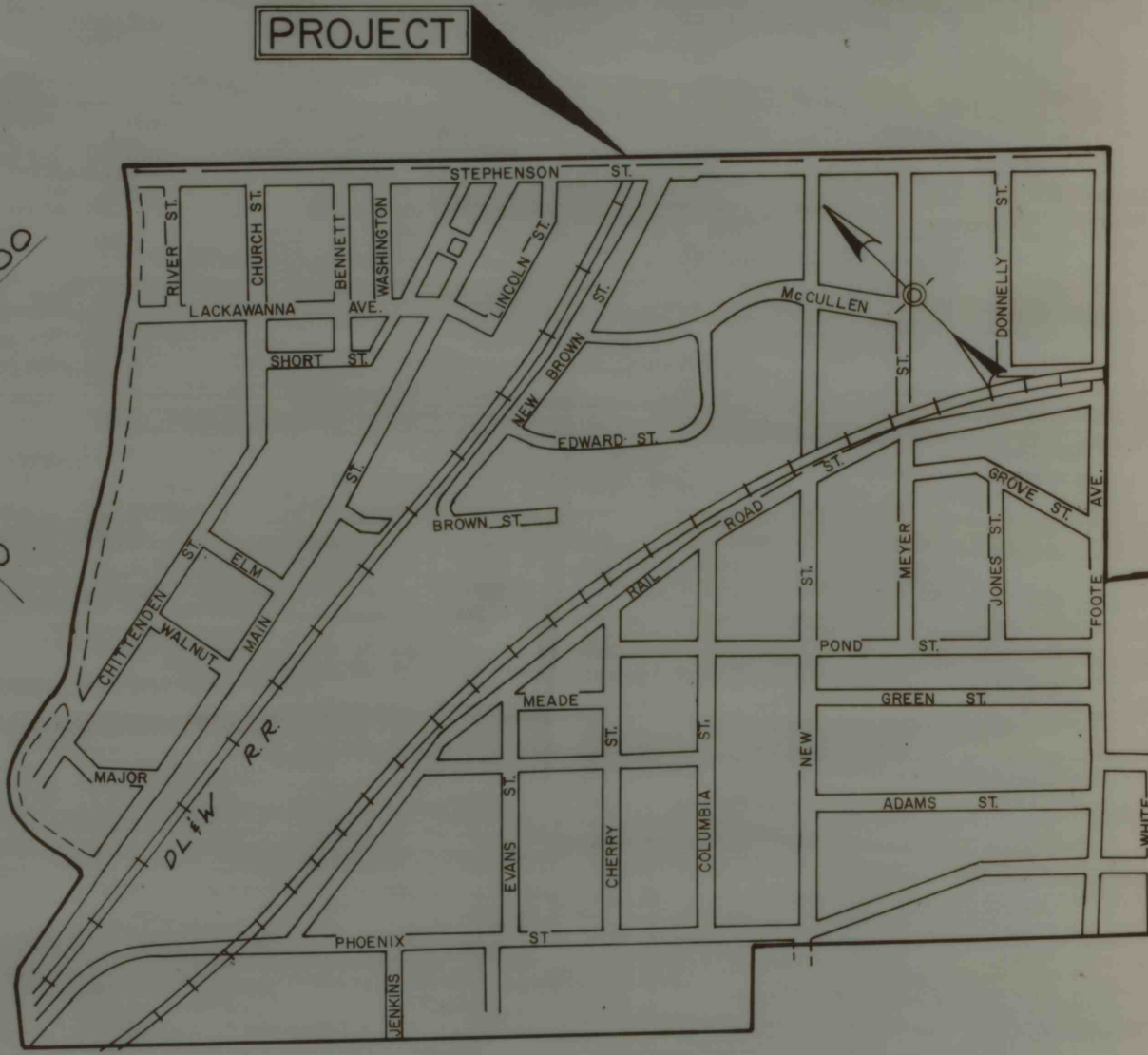
SITE PLAN SCALE: 1" = 666'