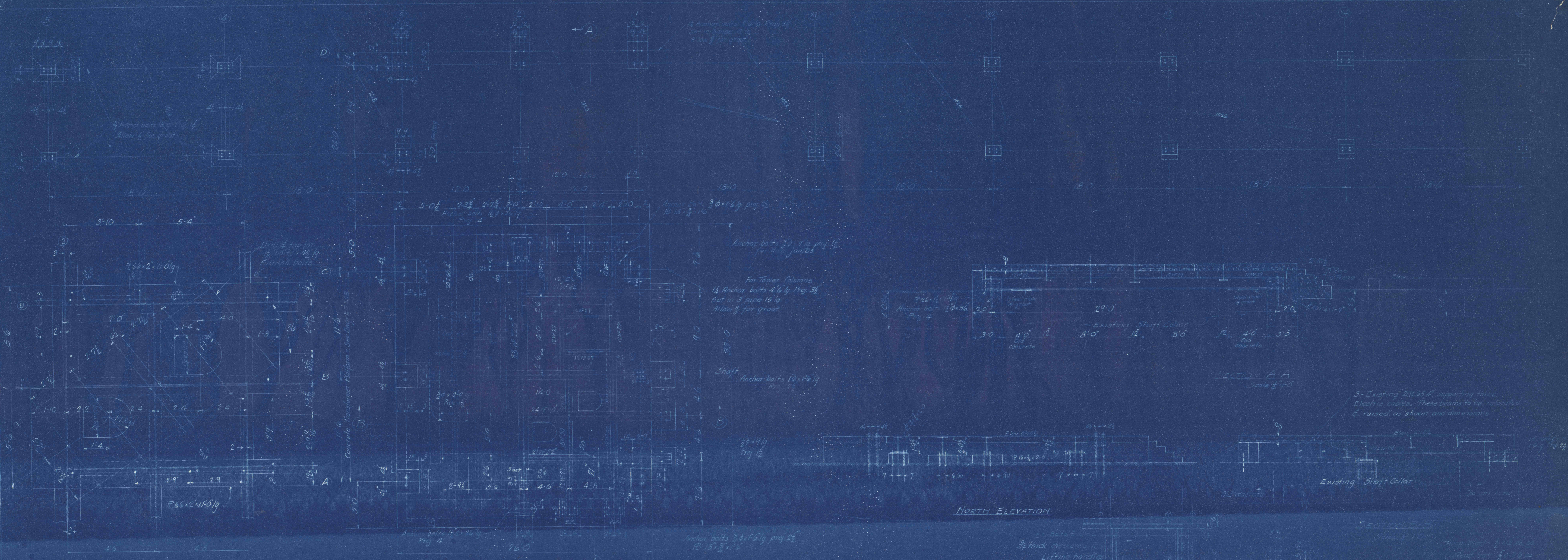
PLAN FOR MOTOR BASE PLATES Scale 1/4" = 1'-0"