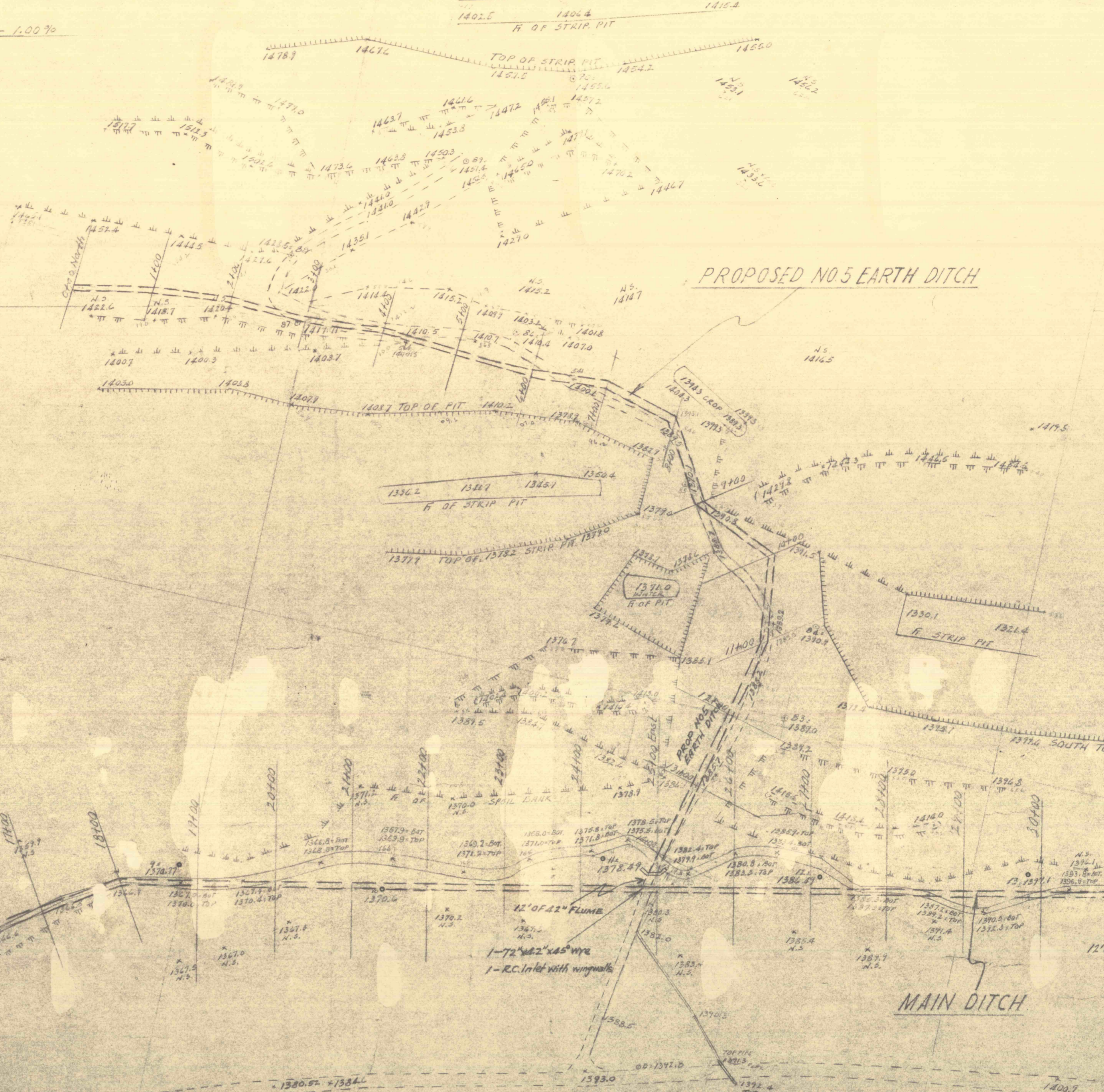
PROPOSED NO. 5 EARTH DITCH