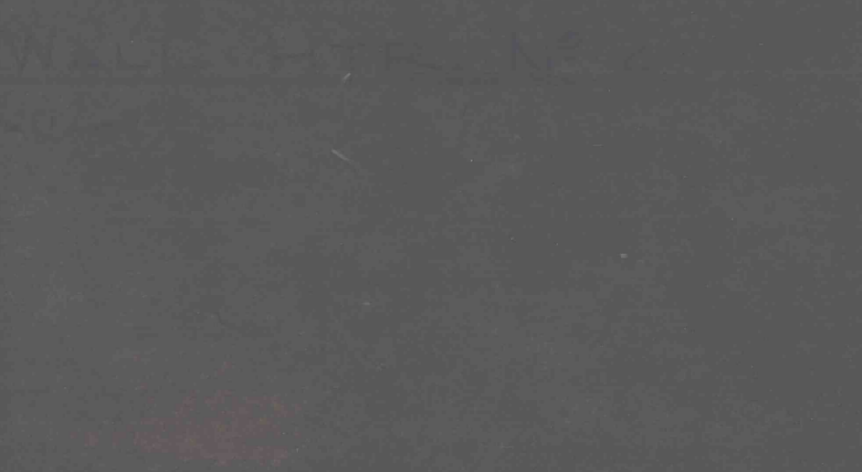
DETAIL F - WALL