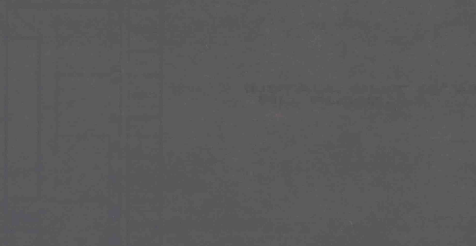
HTR N 3