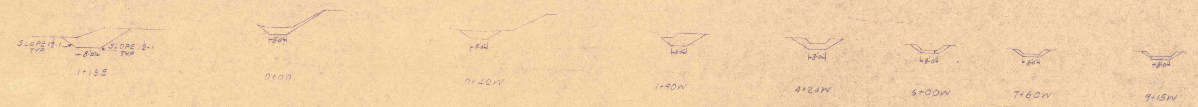
SECTIONS THROUGH PROPOSED CREEK RECONDITIONING SCALE 1"=30'

PENNSYLVANIA DEPARTMENT OF MINES AND MINERAL INDUSTRIES MINE MAP, PROFILE AND SECTIONS RECONDITIONING CREEK HAMMOND MINE DRAINAGE BOREHOLE PROJECT NO. A-21 BUTLER TOWNSHIP, SCHUYLKILL COUNTY NOV. 1966 SCALE AS SHOWN