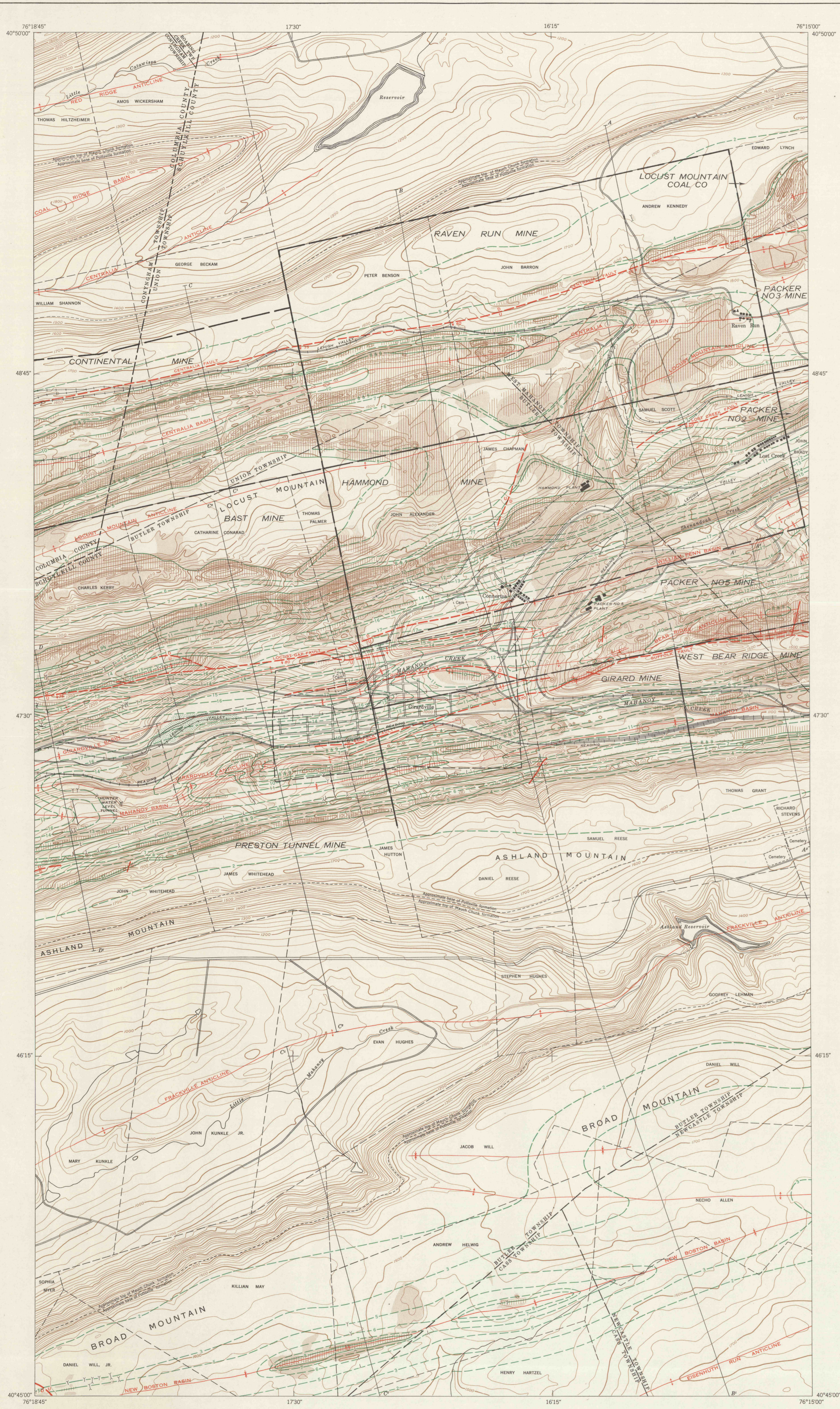
COAL OUTCROP MAP