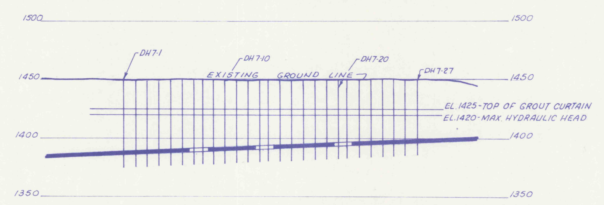
SECTION L-L' SCALE: 1"=50'

END OF EXIST. DRAIN = 040 PROP OVERFLOW BOREHOLE DRAIN PIPE (SEE SHEET 11 OF 12 FOR PROFILE)