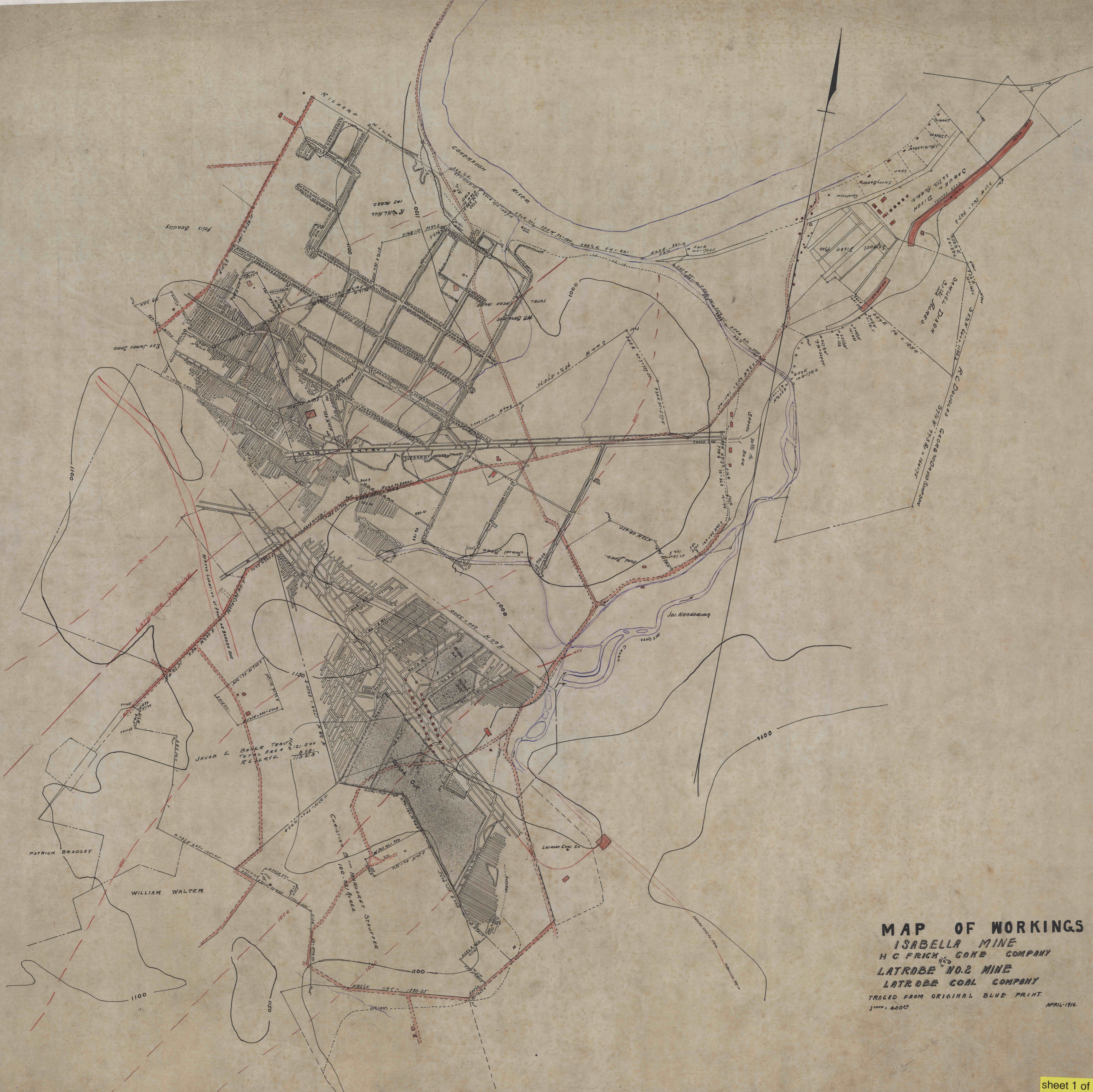
MAP OF WORKINGS ISABELLA MINE H C FRICK COKE COMPANY LATROBE NO. 2 MINE LATROBE COAL COMPANY TRACED FROM ORIGINAL BLUE PRINT. 1" = 400' APRIL 1916.

ENGINEERING DEPARTMENT BORDEN - LATROBE 1000' 100' 100' 100'