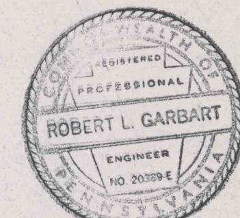
EXHIBIT B-2f MINE WORKINGS

Dept. of Environmental Resources McHurey District Office