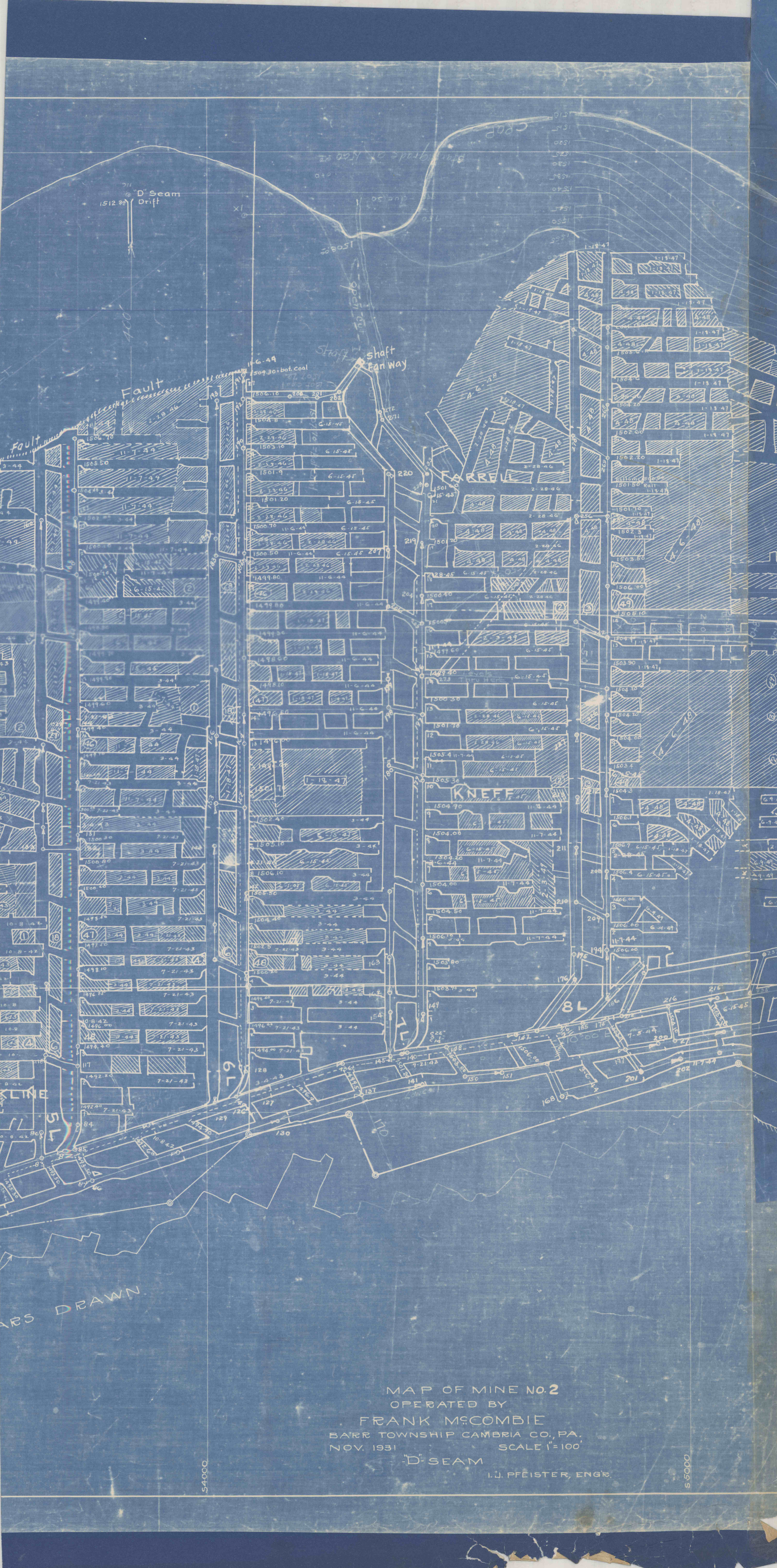
MAP OF MINE NO 2 OPERATED BY FRANK McCOMBIE BARK TOWNSHIP CAMBERIA CO. PA. NOV. 1931 SCALE 1"=100' D SEAM L.J. PFISTER, ENGR.