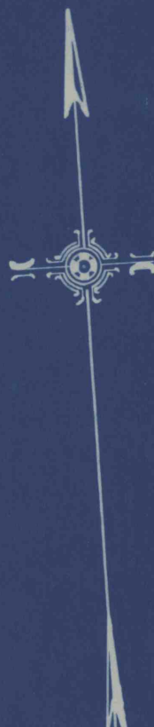
EXHIBIT "B" TRACT No. 6.A.