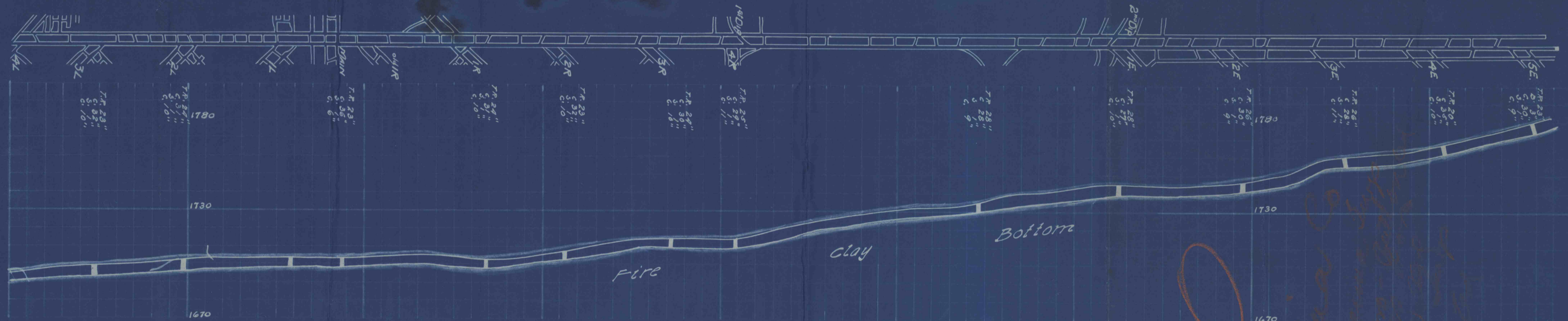
5 RIGHT & 5 LEFT HEADINGS