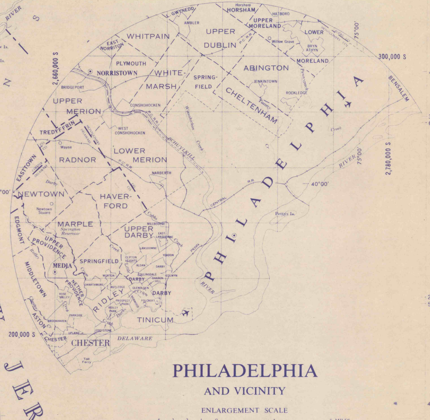
PHILADELPHIA AND VICINITY

ACTIVE DEEP BITUMINOUS MINE PERMIT AREAS MINE SUBSIDENCE AND LAND CONSERVATION ACT OF APRIL 27, 1966