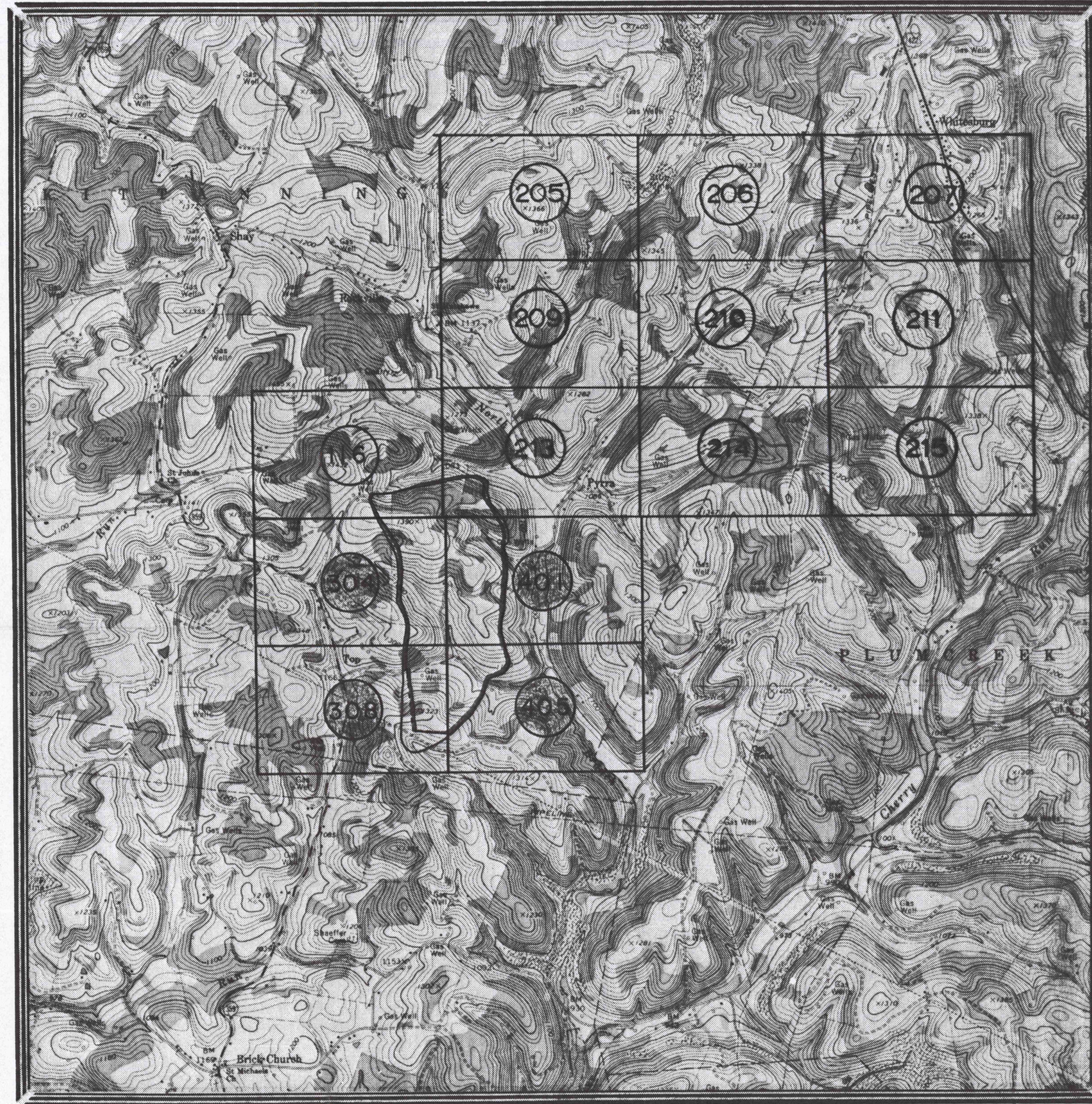
WHITESBURG 7-1/2' U.S.G.S. QUADRANGLE SCALE 1"=2000