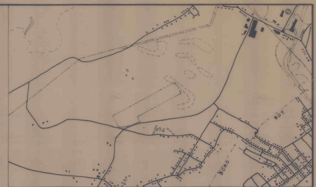
LOCATION MAP SCALE: 1" = 2000'