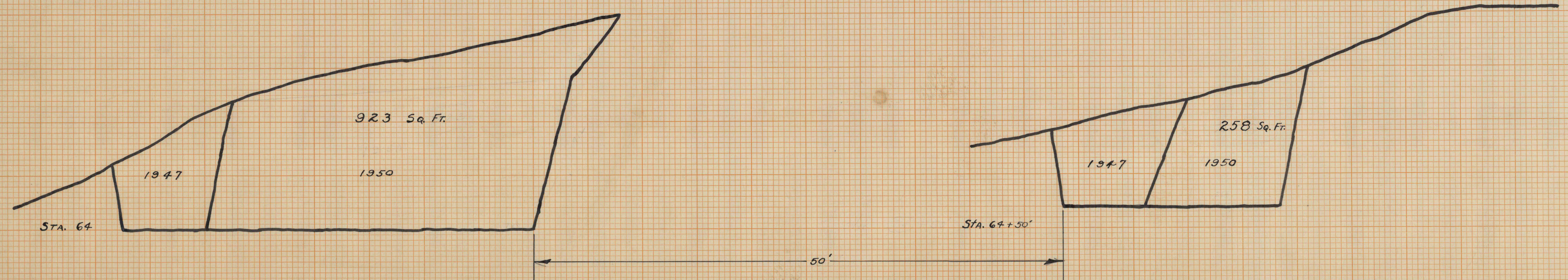
PLATE 1--CROSS SECTION U. P. R. & R. L. STANDARD KEUFFEL & ESSER CO. NEW YORK

DATE _____ BY _____ SURVEYED _____ PLOTTED _____ NOTE BOOK _____ NO. _____ AREAS CHECKED _____