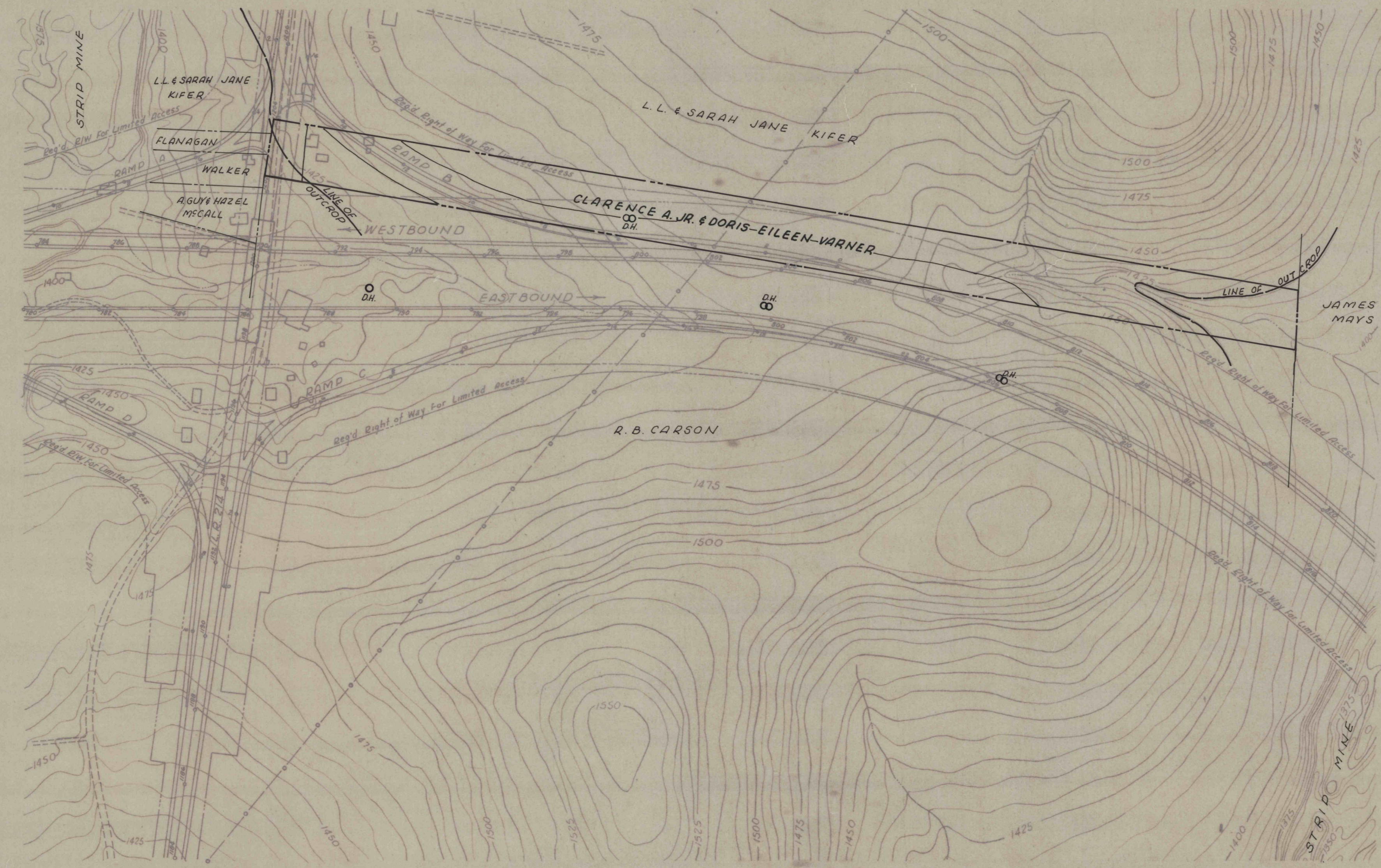
PLAN SCALE: 1"=200'