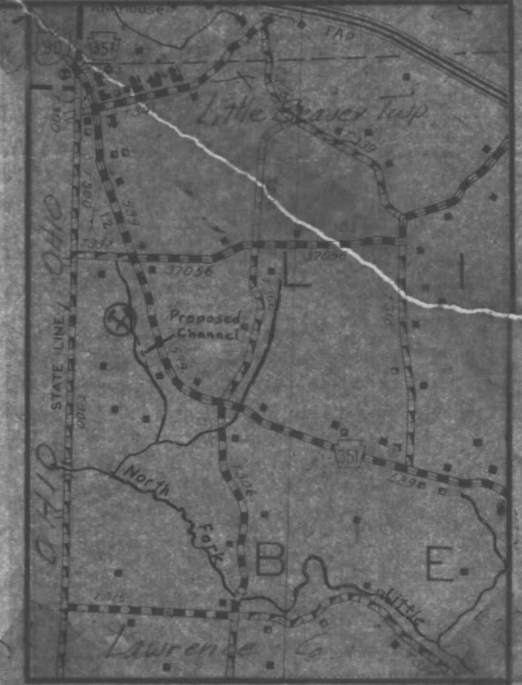
LOCATION MAP SCALE 1" = 1 MILE