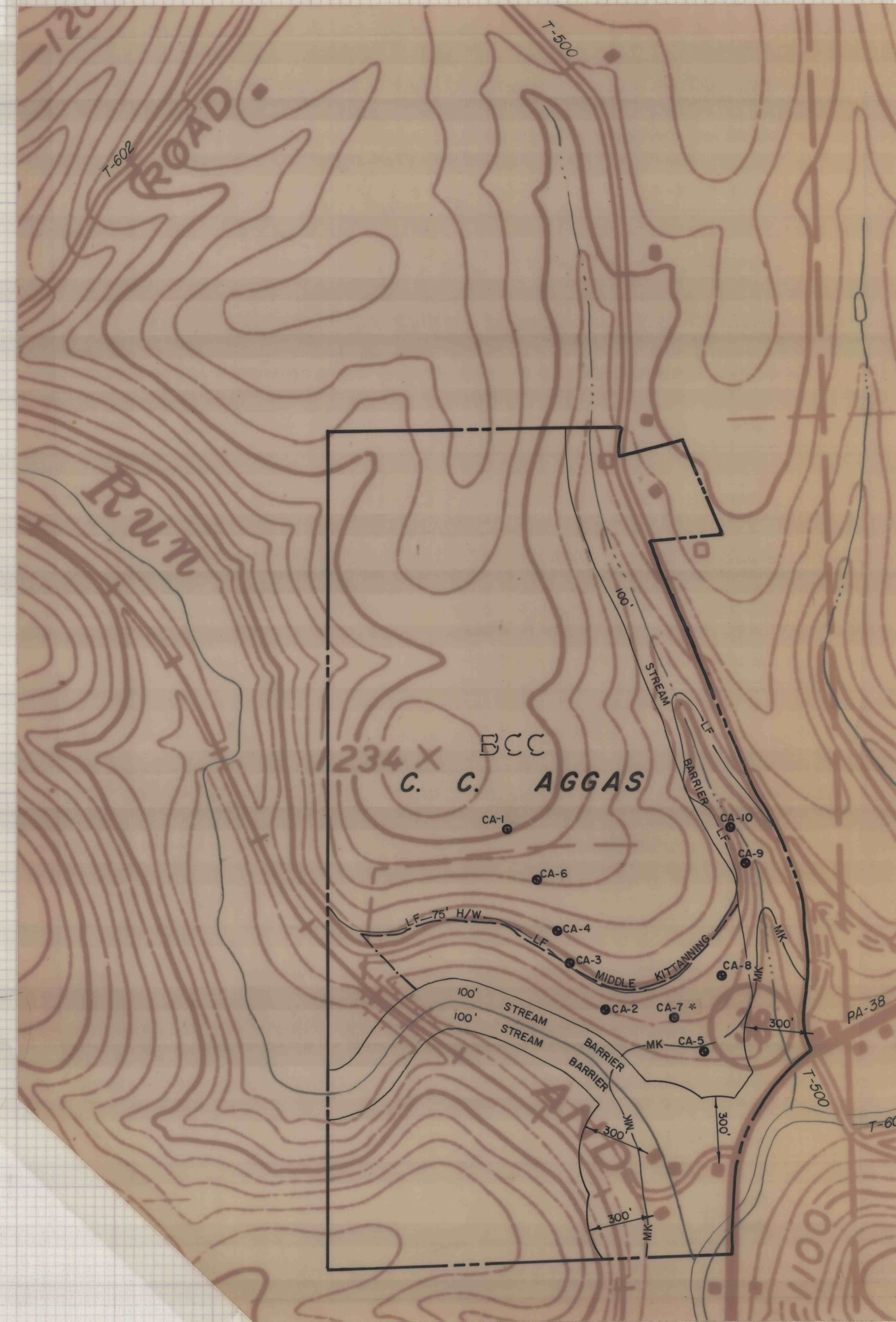
CENTER TWP. MOUNT CHESTNUT QUAD.