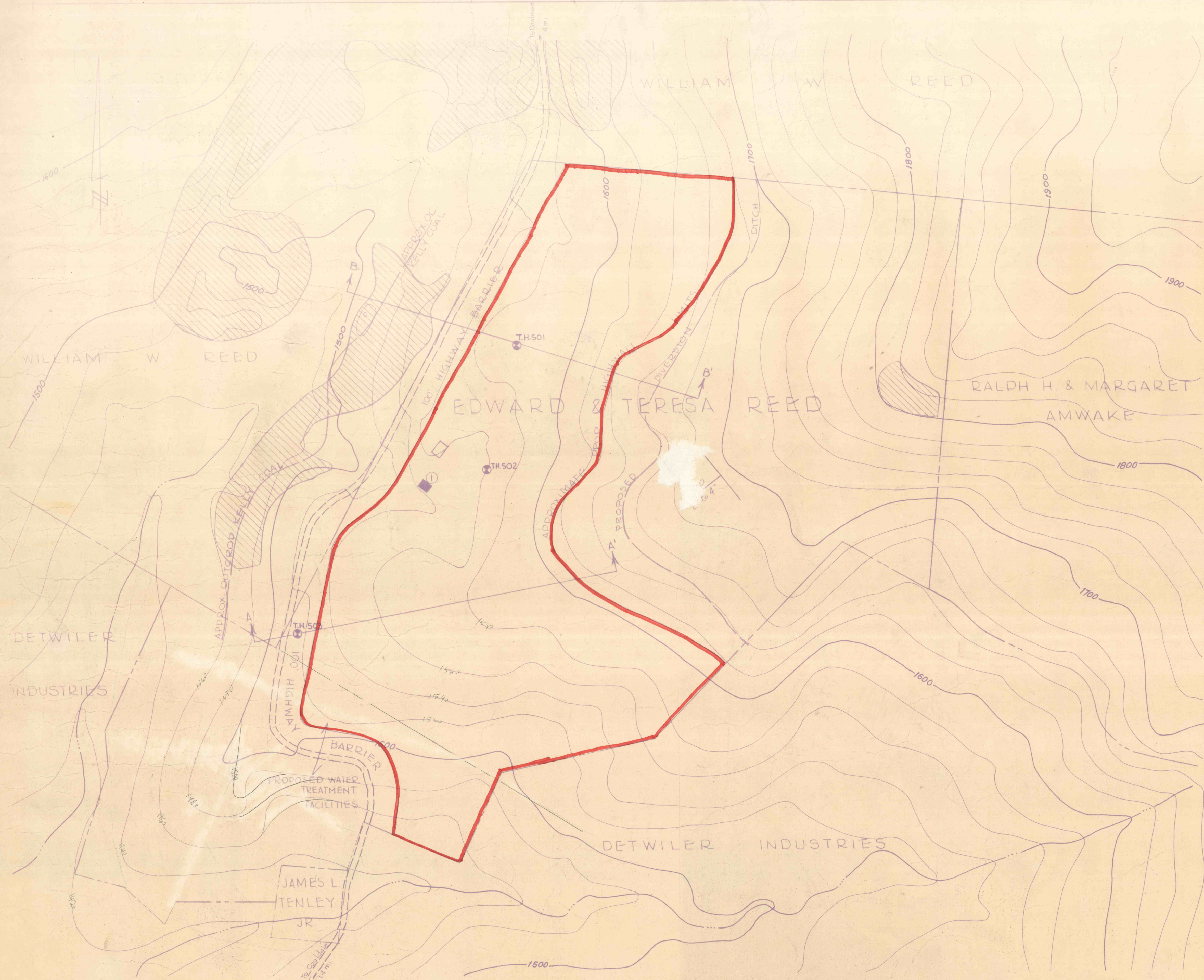
PLAN SCALE: 1" = 200'