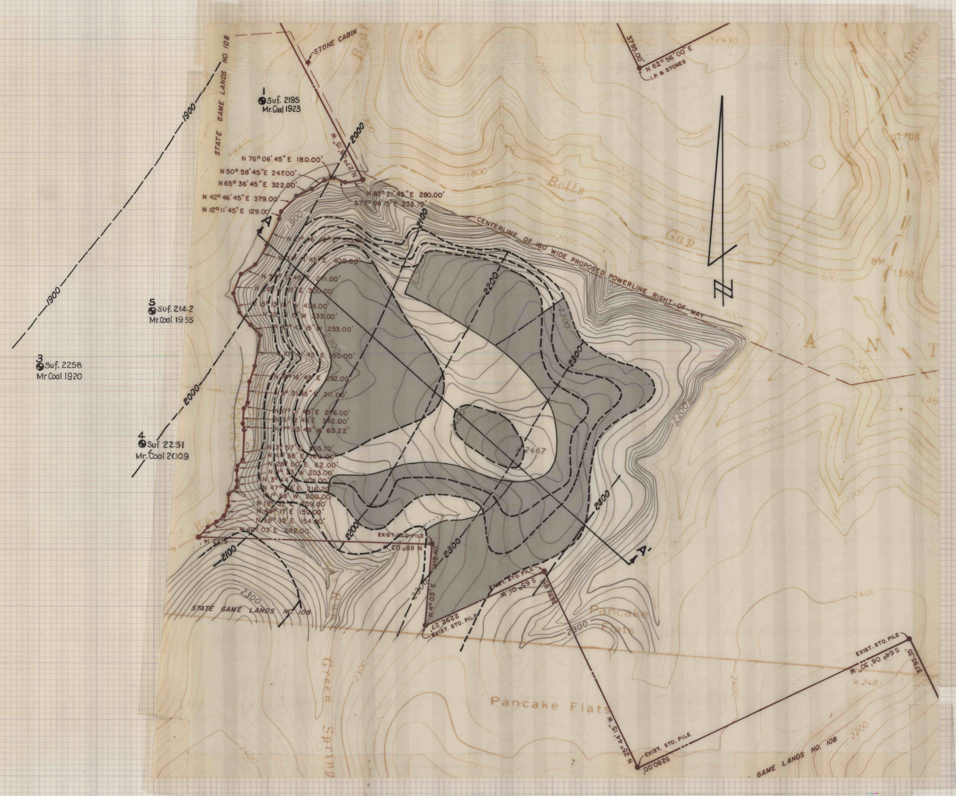
PLAN SCALE: 1" = 1000'